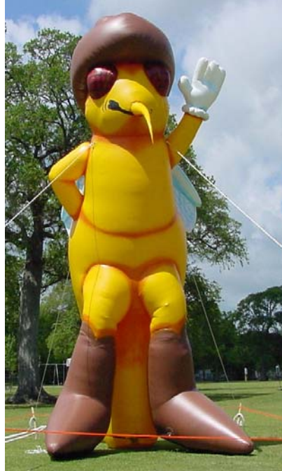
"Willie," the 20-foot-tall mosquito who presides over his festival in Clute, Tex., with the help of Brazoria Co. REACT.

As a new event was created called "The Century